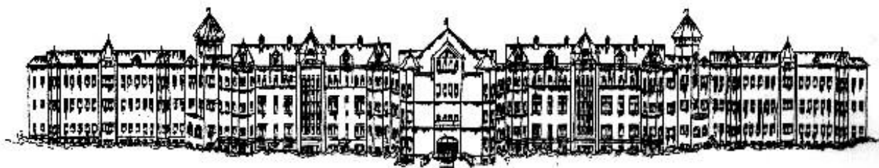
Illustration of Patton State Hospital Circa 1902 Based on a Lithograph by Vern Fowler

Patton State Hospital has provided mental health treatment since 1893 and has been accredited as a forensic mental health facility by the Joint Commission on Accreditation of Healthcare Organizations (JCAHO) since 1987. It is the largest maximum-security forensic hospital in the nation.